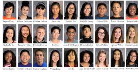
Elk Grove Unified