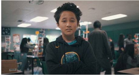
Campbell Union School District Graduate Profile